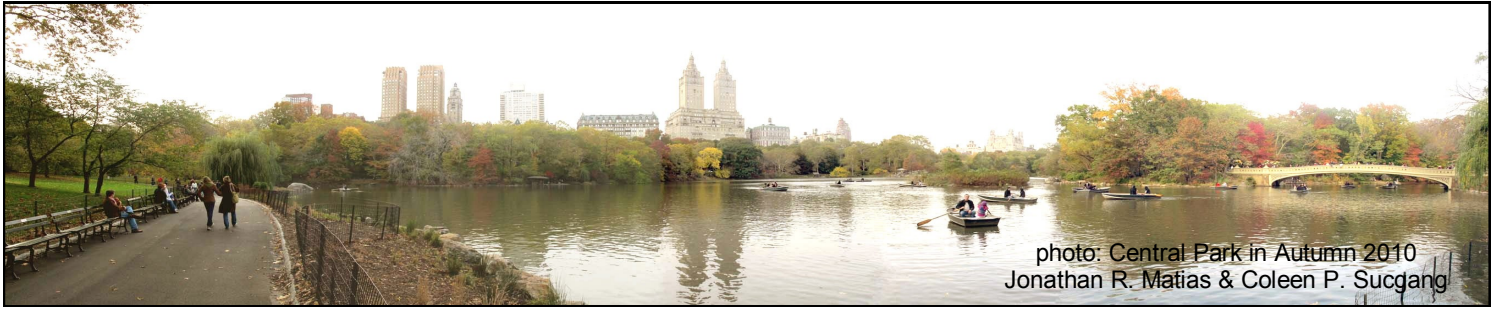
Central Park in Autumn 2010